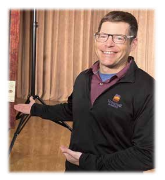
On behalf of all of us at Voyager, welcome back! We hope that you all have enjoyed your summer break and are ready to get back into the FUN here at Voyager.

It has certainly been a hot summer for those of us who were brave enough to stick out the summer in Tucson. Something that helped make the summer more bearable for our guests was spending time in our recently renovated pool area and enjoying the coolness of our new pool decks. The new Desertlock pavers blend rich desert aggregates and seashells gathered from nature to create an elegant look throughout the landscape. These pavers are designed to remain cool in the desert sun and are smooth and comfortable for the feet while meeting high standards for slip resistance.